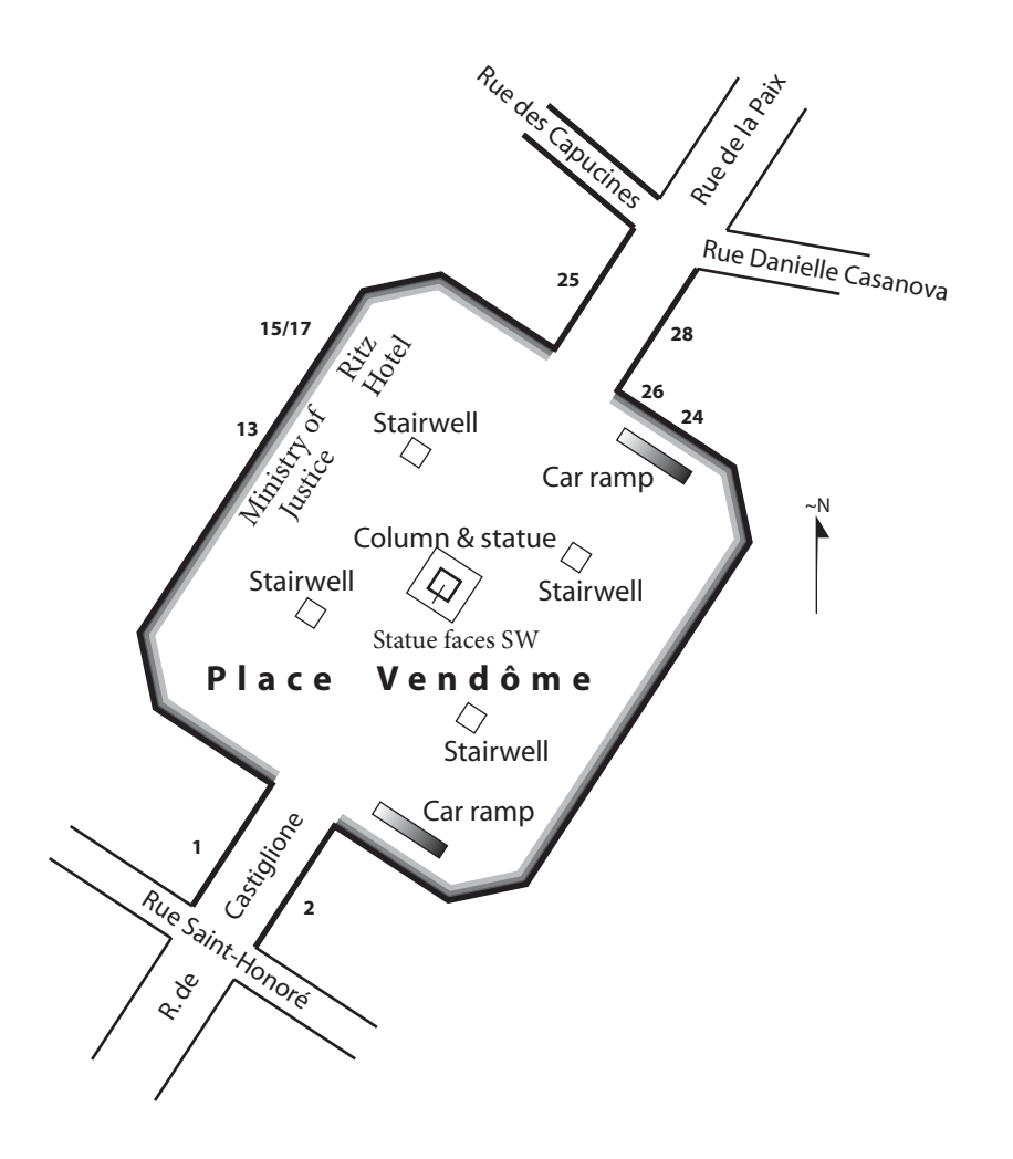
Illustration 4 Plan of Place Vendôme. The first section of the streets leaving the square itself (until the cross-street) continue to have an address of Place Vendôme, as indicated.