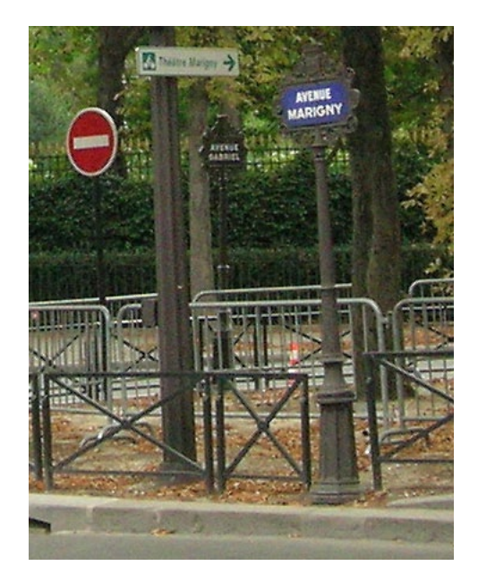
Illustration 5 Above: the corner of Avenue Gabriel and Avenue de Marigny, August 2009, taken from the west side of Marigny looking toward the south-west corner of the Palace.

Below: close-up of the street signs.