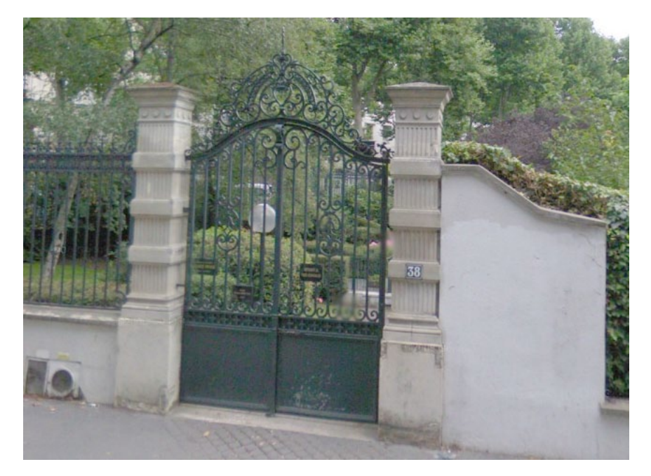
Illustration 2 The relocated Bonnet house gate at the current 38 Rue Parmentier apartment building.

Presumably the various streets, etc., with Parmentier in their title are named after the eighteenthcentury's Antoine-Augustin Parmentier, who should be much better-known. For information about an amazing man, see en.wikipedia.org/wiki/Antoine-Augustin_Parmentier.