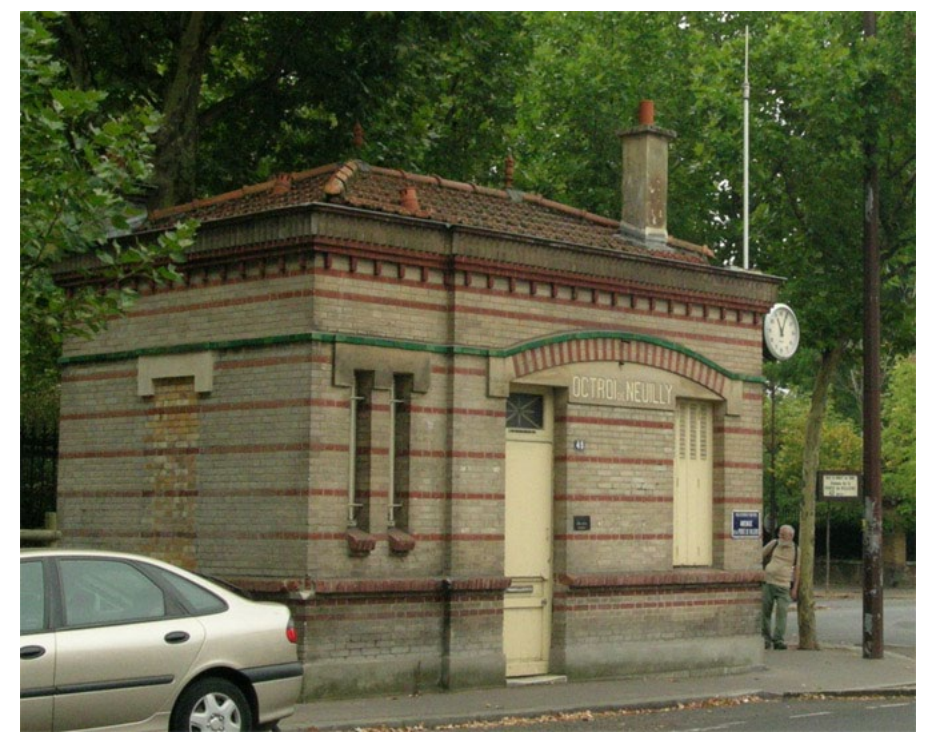
Illustration 1 Octroi de Neuilly, August 2009. My pot-bellied appearance is an optical illusion due to the bunching up of my sweaters. Really.